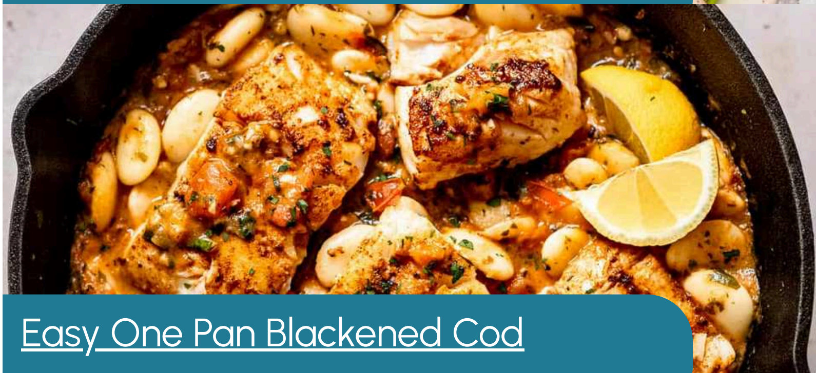
Easy One Pan Blackened Cod