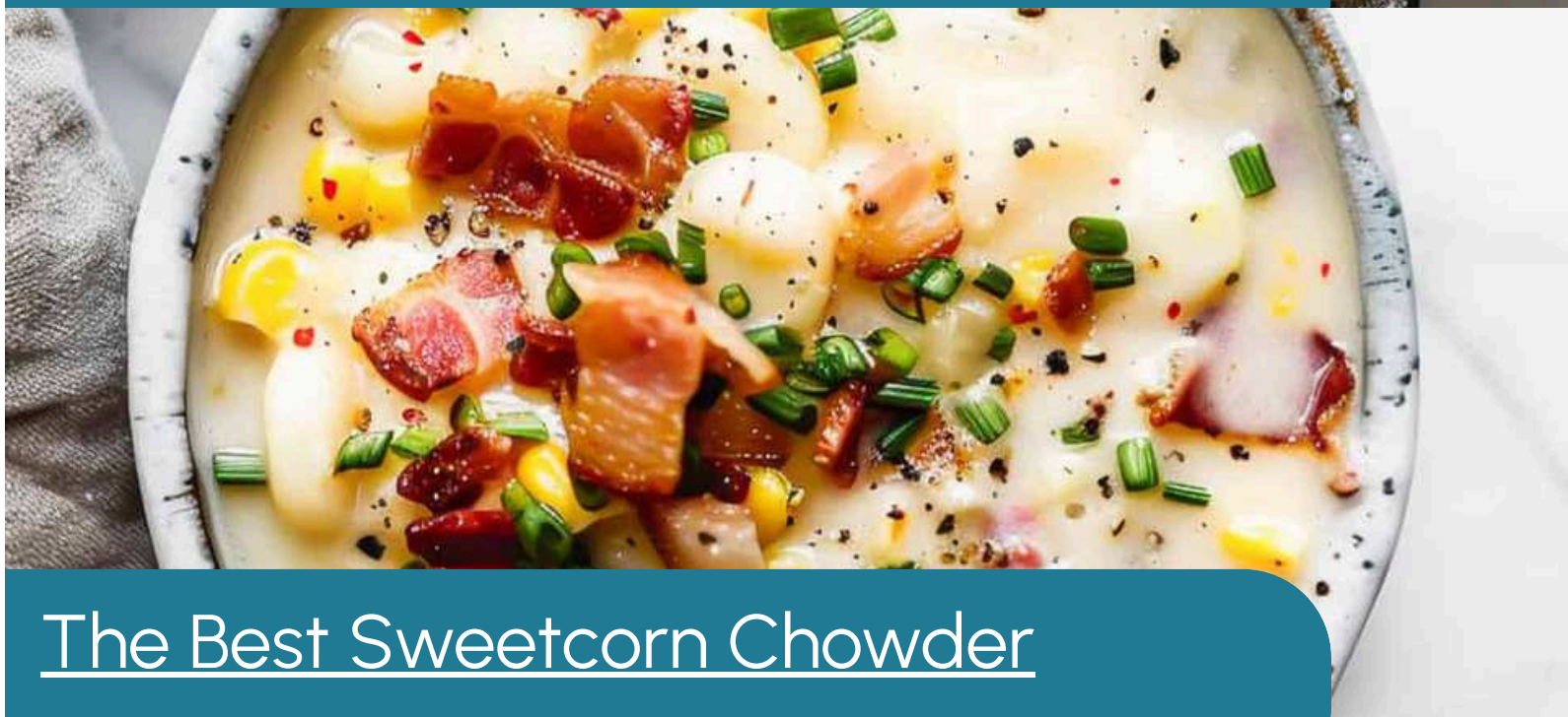
The Best Sweetcorn Chowder