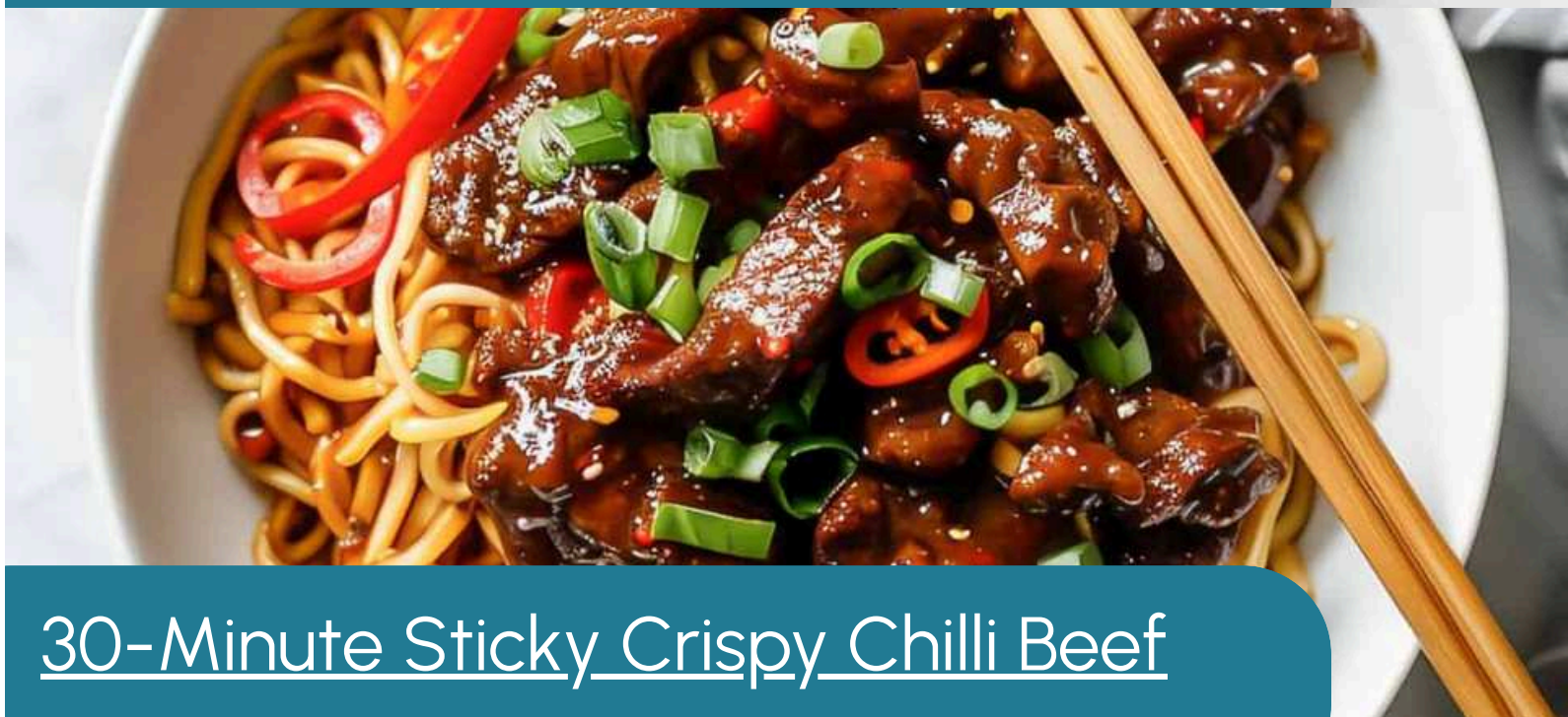
30-Minute Sticky Crispy Chilli Beef