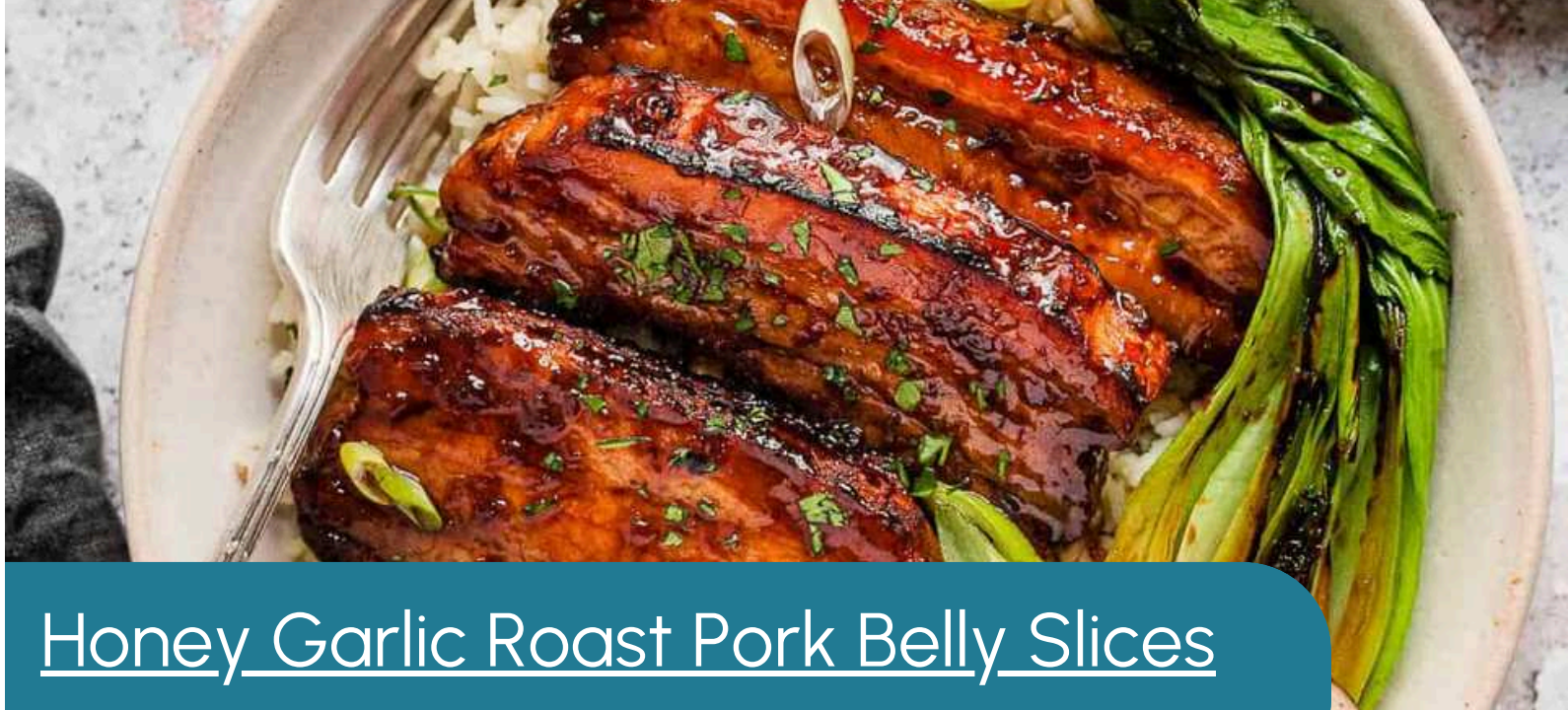
Honey Garlic Roast Pork Belly Slices