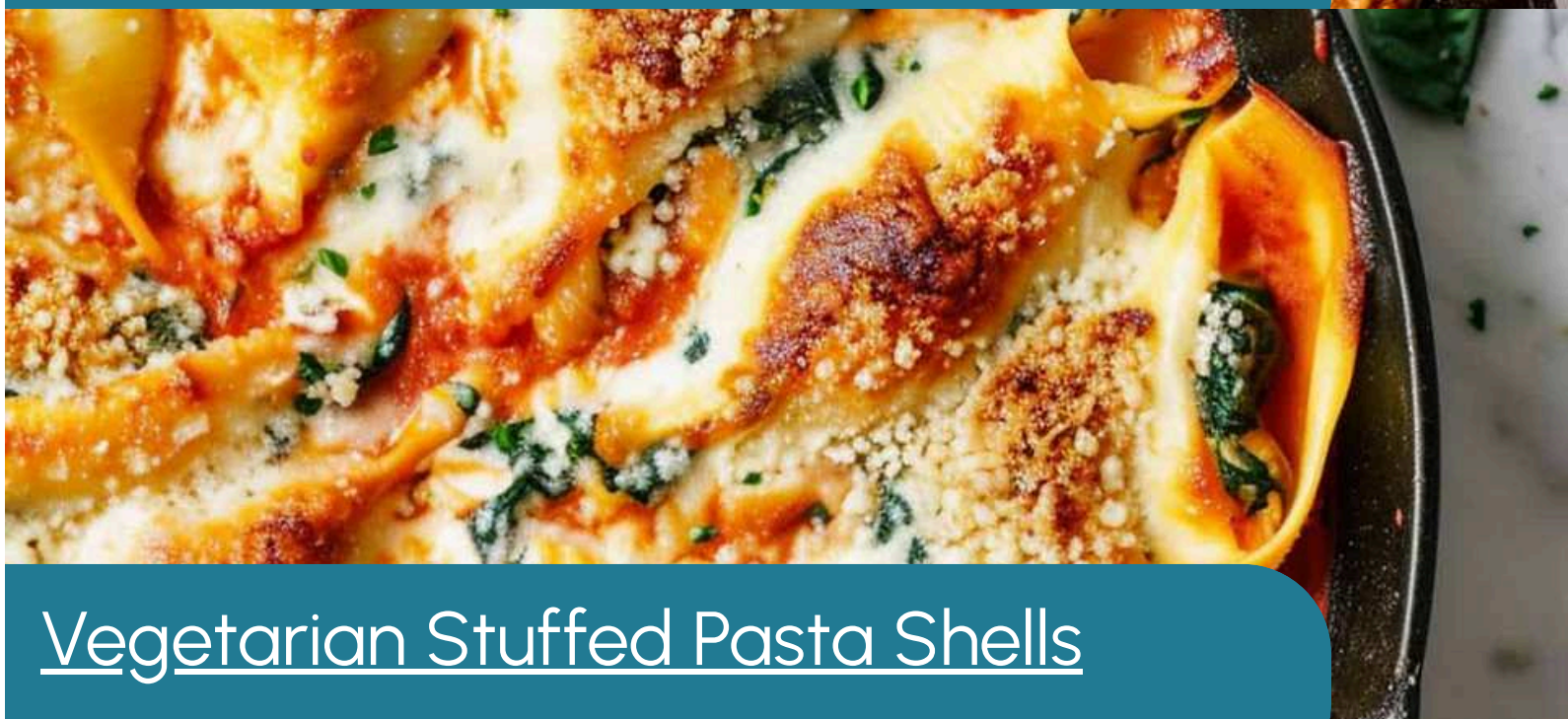
Vegetarian Stuffed Pasta Shells